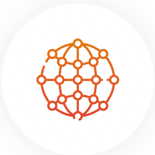
IT system designers