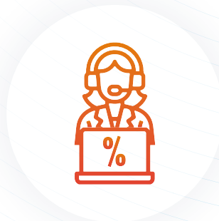
Payroll and labour, and social security specialists