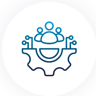
IT database developers