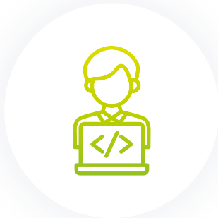
IT program testers