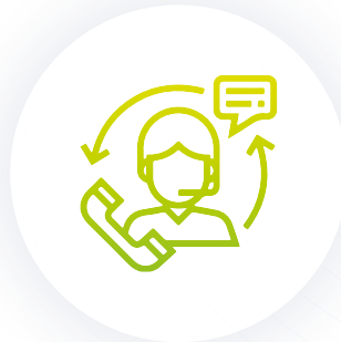
IT customer support specialists